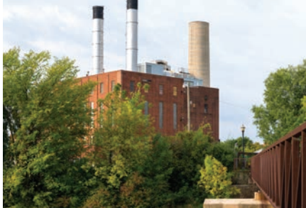
Downtown Power Plant