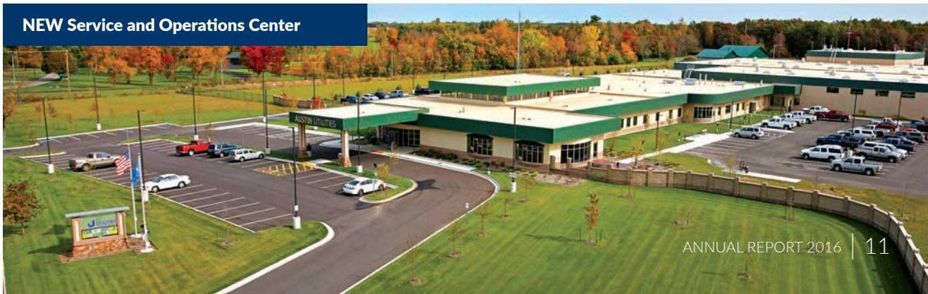
NEW Service and Operations Center

New Service and Operations Center opens to the public July 2016. This building replaces seven buildings on three separate properties and will be the central facility for all Austin Utilities business.