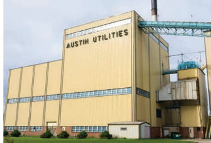
Northeast Power Plant